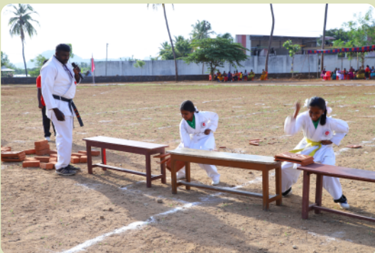
The girls Karate-team smashing bricks.