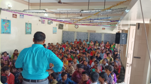
Full house during VBS.