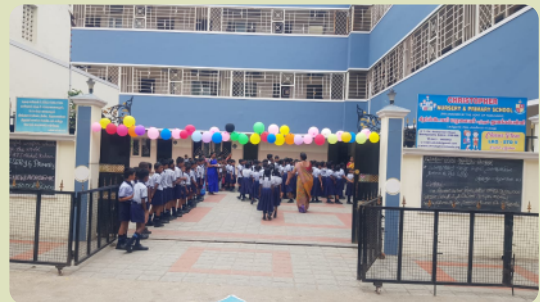
Reopening CNPS after the pandemic

Since school started after the pandemic, we took various initiatives to bring the children up to speed academically. We started with the academic year 2023-24 with an academic year inaugural day. The teachers were introduced, and children were