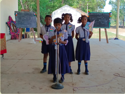
A song for the republic on Independence day.