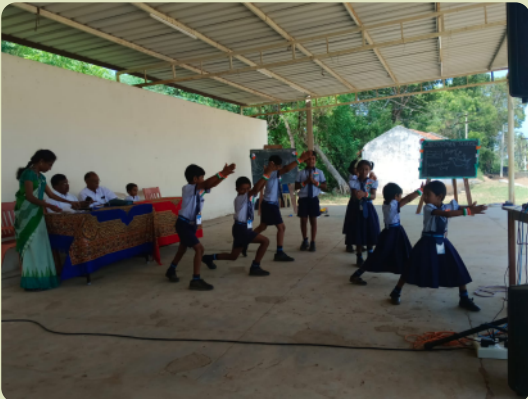
Culturac program on Independence day: Presenting a dance.