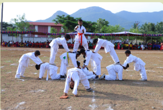
Acrobatics on the pyramide.