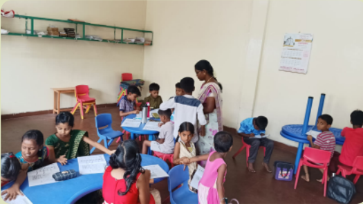
Having fun with handicrafts.