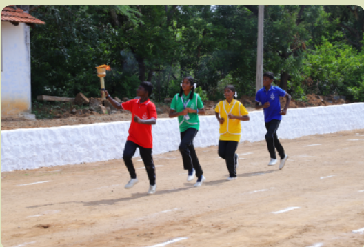
The flame enters the stadium on sports day.

encouraged to participate actively in their lessons and other school activities. All the classrooms have been equipped with audio visual equipment to support digital learning. Various activities were organized for the children to learn by doing and showcase their learning to the parents. Two of these activities were Student Led Conference (SLC) and Student Led Movement (SLM). SLCs were an exhibition of learning models and display of charts to show parents and visitors what the students have learnt. SLMs were rallies and social awareness programs to enlighten the society of environmental protection and personal well-being.