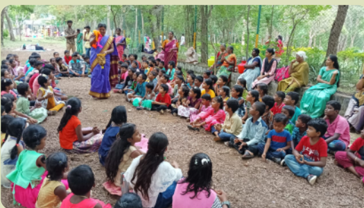
A trip to the forest during VBS.

encouraged them to get to know him. Each family was presented with plum cake for the season.