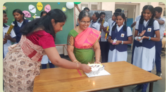
cake for the teachers on Teacher's day.

Blessed are those who show mercy. They will be shown mercy. Mathew 5,7