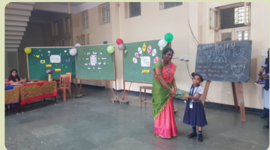
Gifts and ...