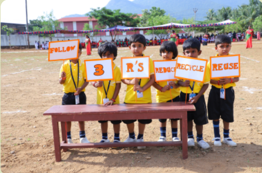
Environmental education on sports day: "Please use 3 R`s: Reduce, Recycle, Reuse".