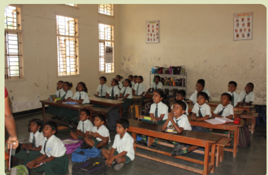
Look into a classroom. There are still not enough tables and chairs for all the children

Blessed are those who show mercy. They will be shown mercy. Mathew 5,7