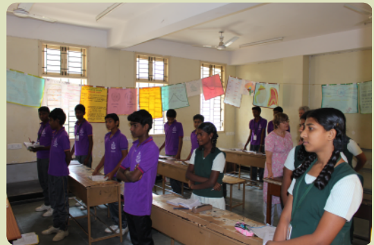
Classroom during a lesson