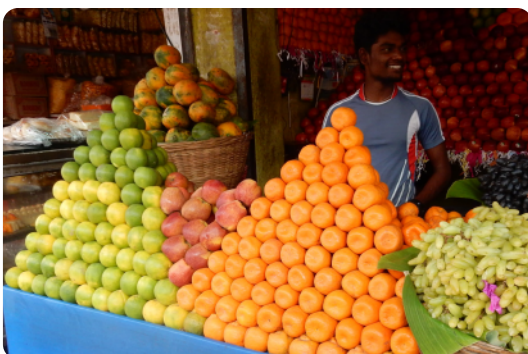
Fruitshop near to a street