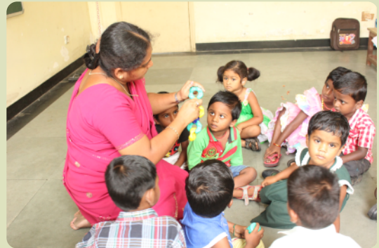
Teacher with kindergarten-children