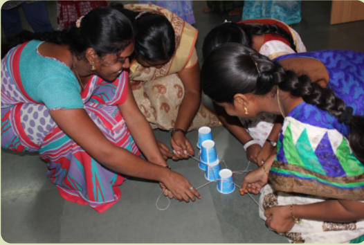
Team Work (Responsibility, involvement & Trust)