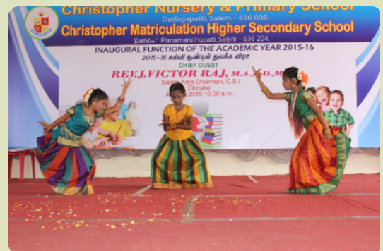
A traditional welcome dance by some of our school children

Blessed are those who show mercy. They will be shown mercy. Mathew 5,7