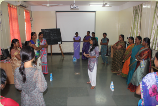
Unity is strength