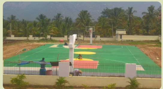
In Panamarathupatti there is now a basketball court for the students and home children to play.

Blessed are those who show mercy. They will be shown mercy. Mathew 5,7