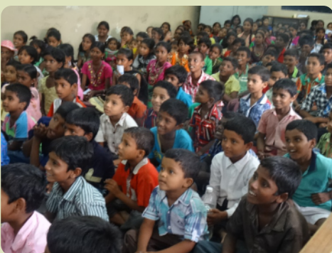
A small part of the participants at the Vacation Bible School.