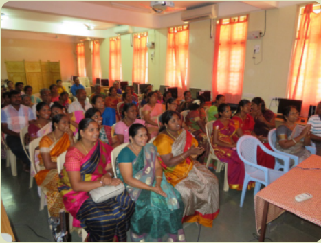
Teaches at the "Teacher`s appreciation day".