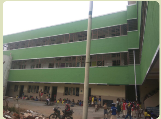
The school in Salem got additional storeys - at last.

T he 'peak' summer in India are three weeks in May where temperatures soar over 40, sometimes 50 ° C. In recent years, the heat lasts much longer. There is very less rain resulting in lower yields in crops, dry wells, no drinking water etc. We need YOU to join hearts with us in prayer for more rain – for with God nothing is impossible!