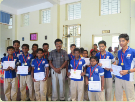
Students winning a prize for good marks - congratulations!